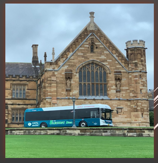
First E12 operator trial commenced in Australia Jan 2019