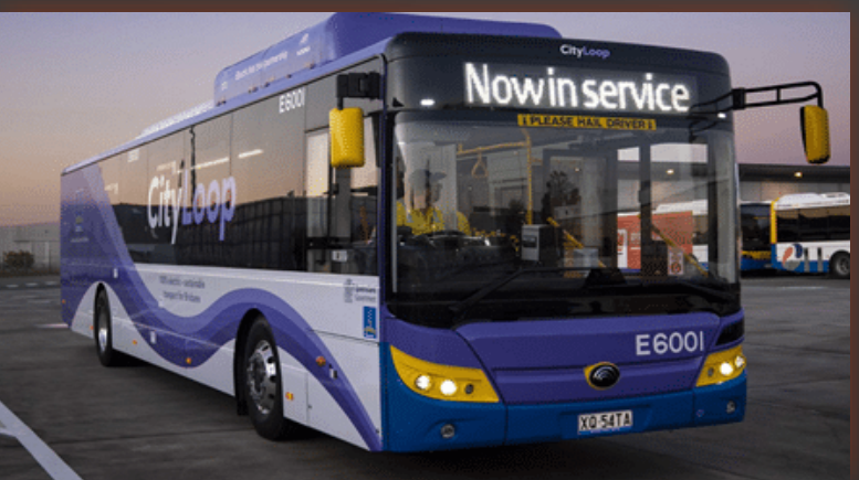
E12 - 350KwH - Operating in Brisbane