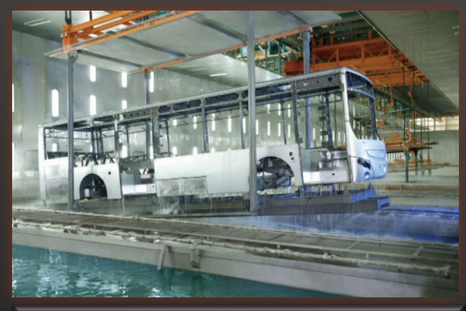
Vehicle is completely electro plated via the Yutong (DURR) 18 stage process