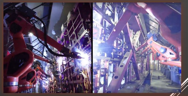
Robot welding and painting