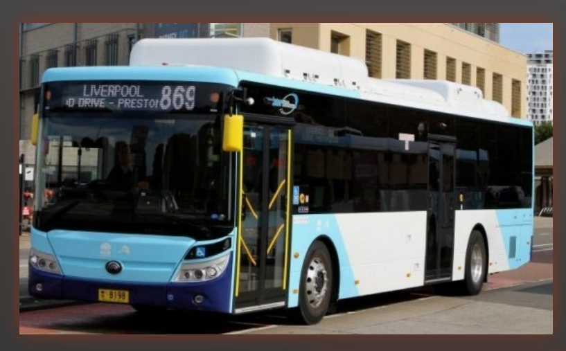
E12 – 422KwH Operating on NSW Contracted Services